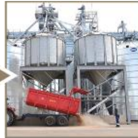
Grain and feedstuff handling and merchandising