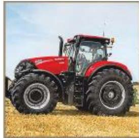
Products and services for farming

The Group's activities are subdivided into main four operating Segments. Division into separate Segments is dictated by different types of products and character of related activities; however, activities of the Segments are often interconnected.